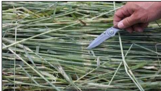
Figure 2. Rye cover crop that has been rolled and crimped.

In 2010, the University of Vermont Extension conducted the second year of an experiment to evaluate the impact of cover crop termination and reduced tillage strategies on soil health, soil nitrogen dynamics, and corn silage yield and quality. The goal is to document the positive and negative aspects of each strategy so farmers can decide the best way to terminate cover crops and implement reduced tillage on their farm.