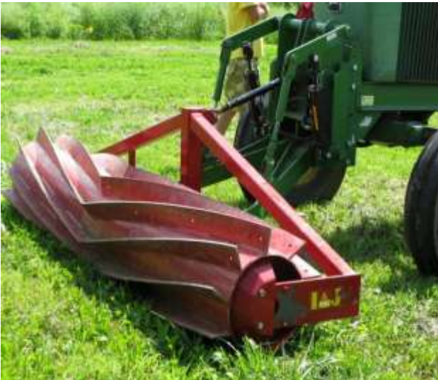
Figure 1. Roller crimper.

When a crop such as corn silage is harvested in the fall, the entire plant is removed, leaving the soil exposed through the winter. These exposed soils are more prone to run-off and erosion of sediment and nutrients into surface waters. As a means to alleviate these issues, many farmers have started to plant cover crops following harvest. Growing a cover crop can have many positive benefits to the soil and the